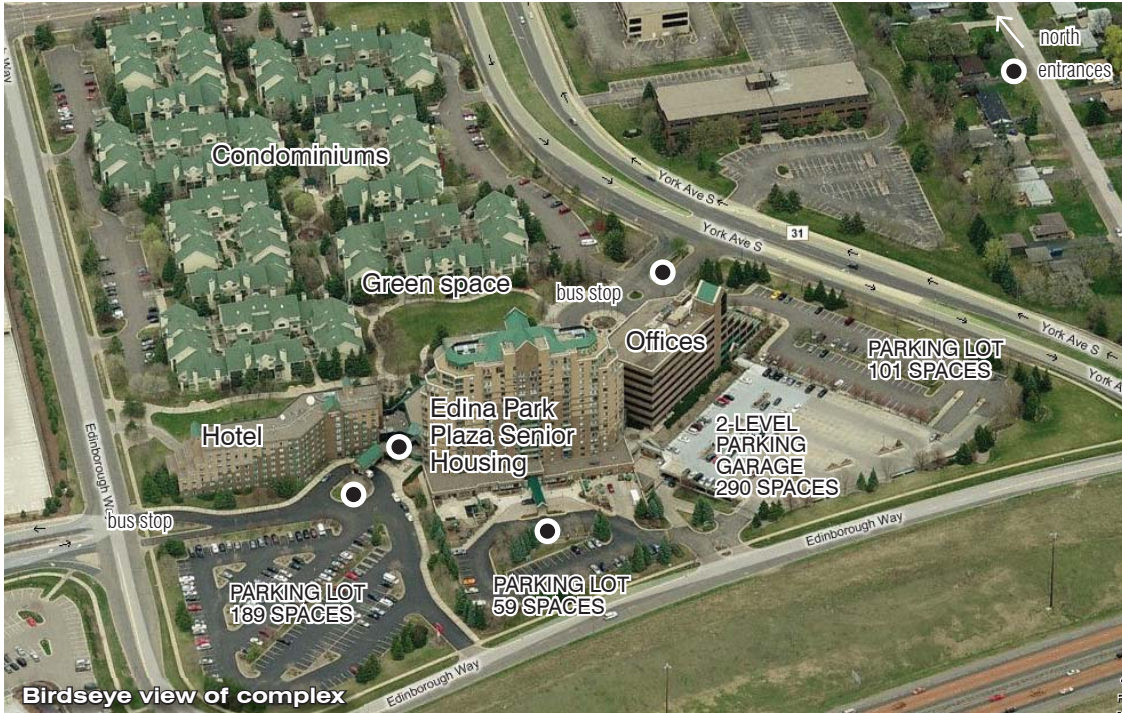
Birdseye view of complex

prepared by U-PLAN | www.u-plan.org | 651/641.0293