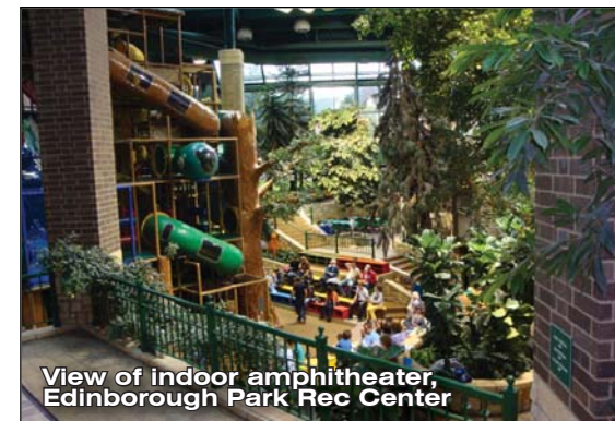
View of indoor amphitheater, Edinborough Park Rec Center