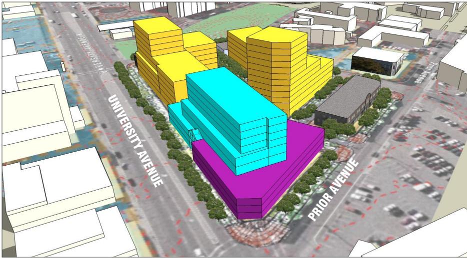
University and Prior Avenues